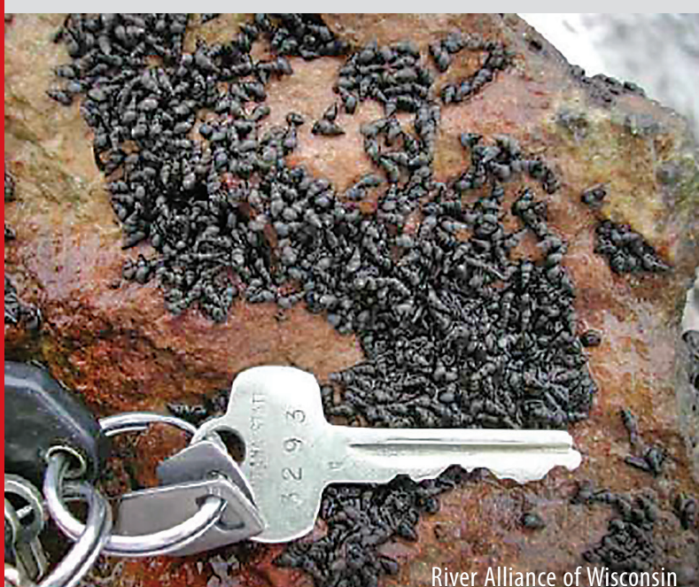
River Alliance of Wisconsin