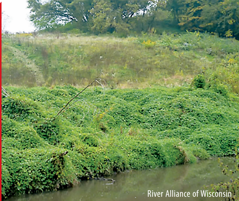
River Alliance of Wisconsin